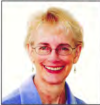
By Lyn Bates, Contributing Editor